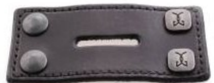
1X leather buckle attachment